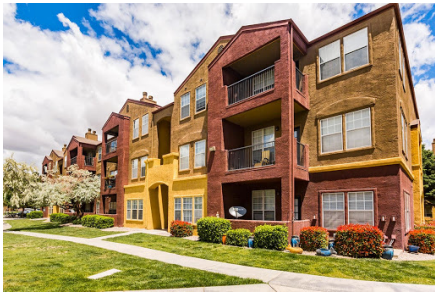
Camino Real Apartments Homes